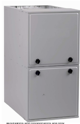
illustrations and photographs are only representative. Some Product models may vary

For installation in SCAQMD only: This furnace does not meet the SCAQMD Rule 1111 14 ng/J NOx emission limit, and thus is subject to a mitigation fee of up to $450. This furnace is not eligible for the Clean Air Furnace Rebate Program: www.CleanAirFurnaceRebate.com